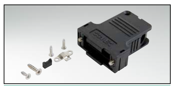
RoHS compliant - CSA listed, File No.: LR 115000-1 - UL listed, File No.: E202784