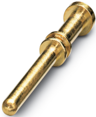
Crimp contact, turned, Single contact, contact diameter: 2 mm, crimp range: 0.14 mm 2 ... 0.25 mm 2

Please be informed that the data shown in this PDF Document is generated from our Online Catalog. Please find the complete data in the user's documentation. Our General Terms of Use for Downloads are valid ( http://phoenixcontact.com/download )