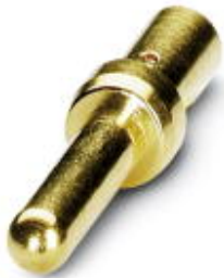
Crimp contact, turned, Single contact, contact diameter: 1 mm, crimp range: 0.14 mm 2 ... 0.56 mm 2

Please be informed that the data shown in this PDF Document is generated from our Online Catalog. Please find the complete data in the user's documentation. Our General Terms of Use for Downloads are valid ( http://phoenixcontact.com/download )