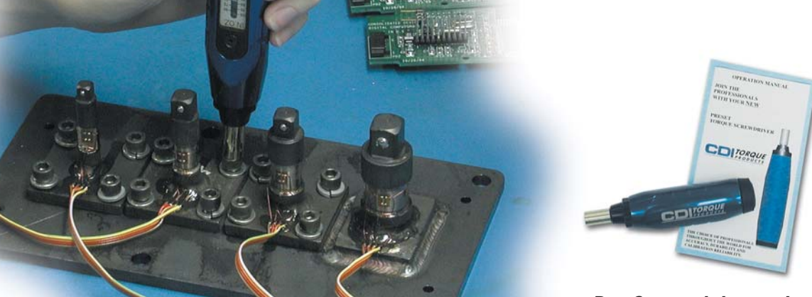
Pre-Set models can be factory set to a specific torque requirement