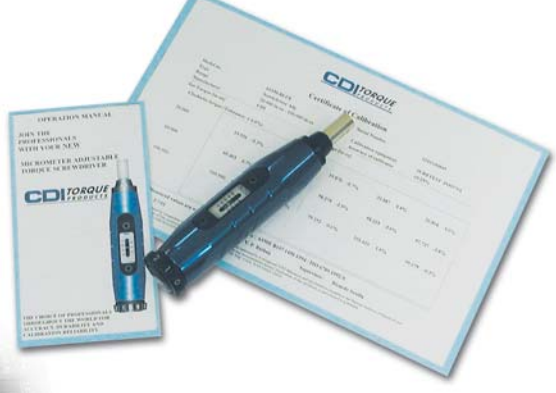
Adjustable Models Supplied with Certification of Calibration