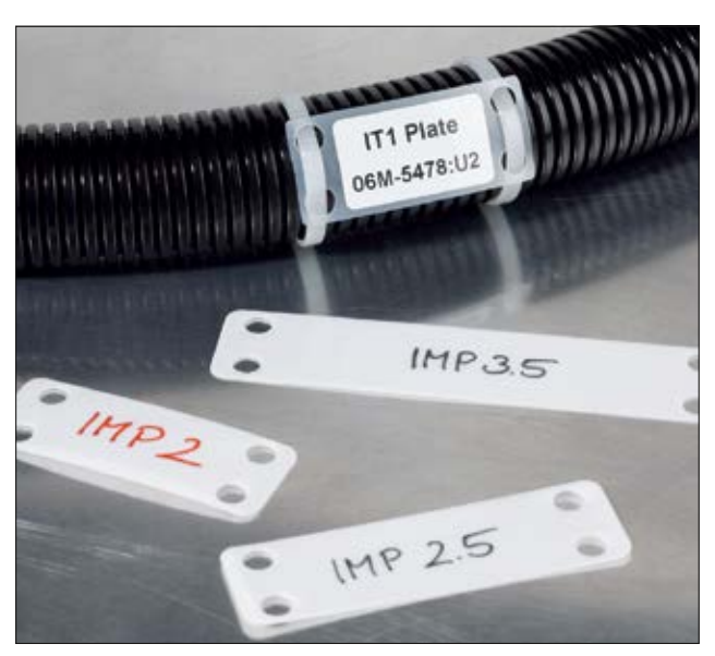
Unlimited cable bundle diameters can be securely identified.