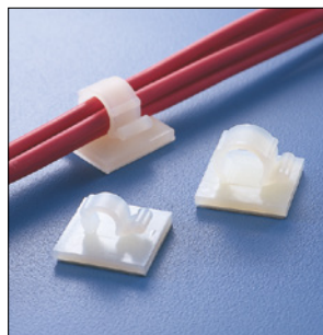
One piece fixing clips Type RA - quick and easy installation.