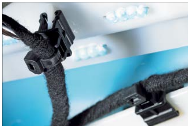
T50ROSEC10 fitted onto a plastic panel to hold a Ø 6 mm harness.