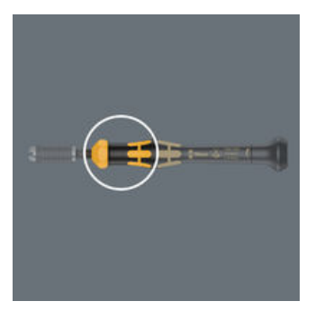
The precision zone directly above the blade gives the user a better feel for the right rotation angle during fine adjustment work.