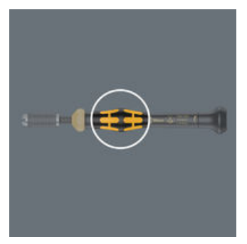
The power zone has integrated soft zones near the blade tip to ensure high torque transfer for loosening or tightening screws without losing contact with the screw.