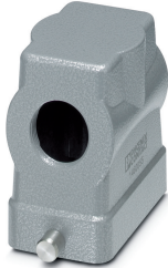
HEAVYCON B10 sleeve housing, for single locking latch, height: 72 mm, with 1 x M25 thread, lateral cable outlet

Please be informed that the data shown in this PDF Document is generated from our Online Catalog. Please find the complete data in the user's documentation. Our General Terms of Use for Downloads are valid ( http://phoenixcontact.com/download )