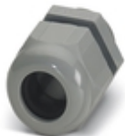
Cable gland, cable gland material: PA, external cable diameter 11 mm ... 17 mm, shielding: no, connecting thread: M25 x 1.5, color: silver-gray RAL 7001

Cable gland - G-INS-M25-M68N-PNES-GY - 1411126