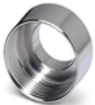
Step-up adapter, M25 to M32, including O-ring

Extension adapter - ENLAR-M-KV-M25/M32 - 1647679