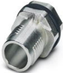
M12-SPEEDCON housing screw connection for M12 male inserts, with flat gasket, for all Speedcon-compatible THR and wave soldering contact carriers

Please be informed that the data shown in this PDF Document is generated from our Online Catalog. Please find the complete data in the user's documentation. Our General Terms of Use for Downloads are valid ( http://phoenixcontact.com/download )