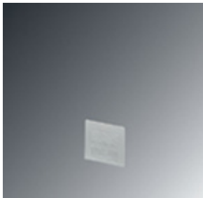
End cover, Length: 28 mm, Width: 1 mm, Height: 26.2 mm, Color: gray

Please be informed that the data shown in this PDF Document is generated from our Online Catalog. Please find the complete data in the user's documentation. Our General Terms of Use for Downloads are valid ( http://download.phoenixcontact.com )