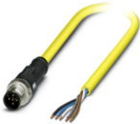
Sensor/Actuator cable, 5-position, PVC, yellow RAL 1021, Plug straight M12 SPEEDCON, A-coded, on free cable end, Cable length: 5 m

Please be informed that the data shown in this PDF Document is generated from our Online Catalog. Please find the complete data in the user's documentation. Our General Terms of Use for Downloads are valid ( http://phoenixcontact.com/download )