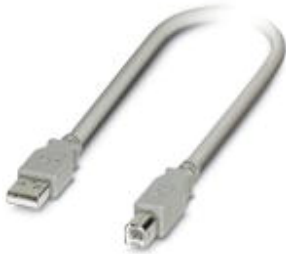
USB cable, with USB connectors at both ends, assembled connector type: A on B, length:1.8 m

Please be informed that the data shown in this PDF Document is generated from our Online Catalog. Please find the complete data in the user's documentation. Our General Terms of Use for Downloads are valid ( http://phoenixcontact.com/download )