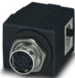
Control cabinet feed-through, M12, 8-pos., A-coded on RJ45 socket, socket input 90°, IP65/67

Please be informed that the data shown in this PDF Document is generated from our Online Catalog. Please find the complete data in the user's documentation. Our General Terms of Use for Downloads are valid ( http://phoenixcontact.com/download )