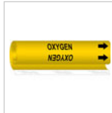
OXYGEN Pipe Marker