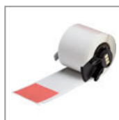
BMP61 M611 TLS 2200 Self-