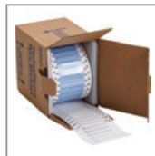
3" Core Series PermaSleeve Polyolefin Wire Marking Sleeves $284.99 (USD)