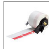
BMP61 M611 TLS 2200 Self- Laminating Vinyl Wire and Cable Labels $67.99 (USD)