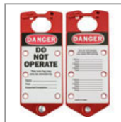
Labeled Lockout Hasps $88.99 (USD)