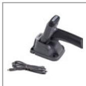
CR3600 (BATCH VIA USB) Handle Configuration with B4 Battery, Charging Station and USB $988.99 (USD)