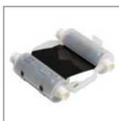
B30 Series R6200 Printer