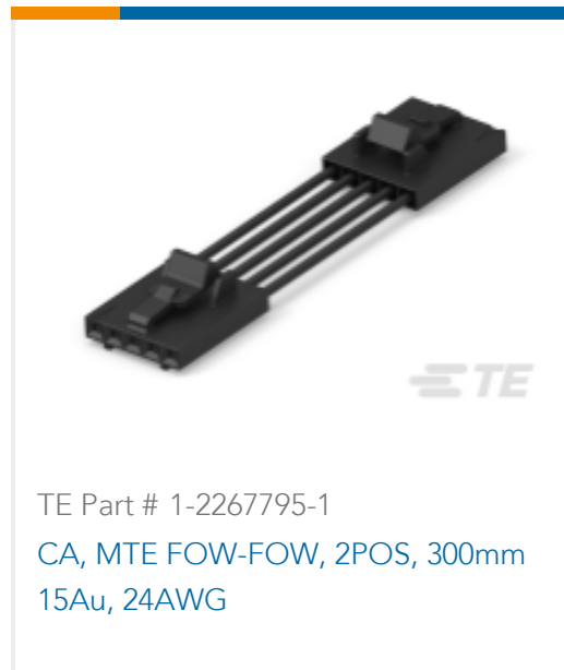
TE Part # 1-2267795-1 CA, MTE FOW-FOW, 2POS, 300mm 15Au, 24AWG