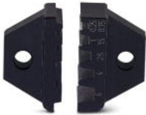
Spare die for CRIMPFOX 6

Please be informed that the data shown in this PDF Document is generated from our Online Catalog. Please find the complete data in the user's documentation. Our General Terms of Use for Downloads are valid ( http://phoenixcontact.com/download )