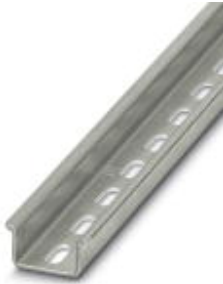
NS 35 DIN rail, according to customer specifications, height: 15 mm, width: 35 mm

Please be informed that the data shown in this PDF Document is generated from our Online Catalog. Please find the complete data in the user's documentation. Our General Terms of Use for Downloads are valid ( http://phoenixcontact.com/download )