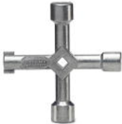
Control cabinet key, metal, for all common types of control cabinet

Please be informed that the data shown in this PDF Document is generated from our Online Catalog. Please find the complete data in the user's documentation. Our General Terms of Use for Downloads are valid ( http://phoenixcontact.com/download )