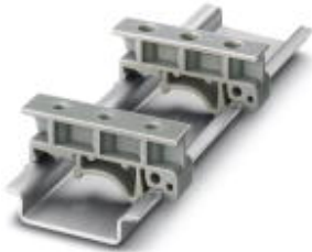
Rail adapters, for M3 screws, Length: 42.6 mm, Width: 10 mm, Height: 19 mm, Color: gray

Please be informed that the data shown in this PDF Document is generated from our Online Catalog. Please find the complete data in the user's documentation. Our General Terms of Use for Downloads are valid ( http://phoenixcontact.com/download )