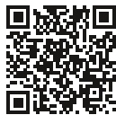
Application video: RELK