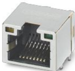
RJ45 socket insert, degree of protection: IP20, 10 Gbps, connection method: Solder connection

Please be informed that the data shown in this PDF Document is generated from our Online Catalog. Please find the complete data in the user's documentation. Our General Terms of Use for Downloads are valid ( http://phoenixcontact.com/download )