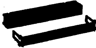
Receptacle and Cover