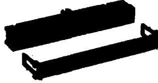
Receptacle and Cover