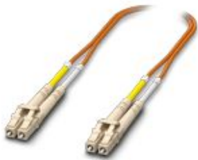
Multi-mode OM2 duplex jumper, LC-LC, UPC polishing, length 2 m

Please be informed that the data shown in this PDF Document is generated from our Online Catalog. Please find the complete data in the user's documentation. Our General Terms of Use for Downloads are valid ( http://phoenixcontact.com/download )