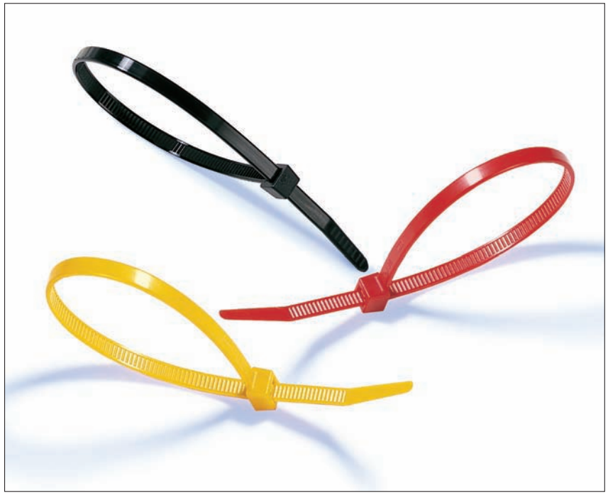
T Series for bundling and securing of cables for a wide range of applications, available in various colours and materials.

For the routing, bundling and securing of cables, pipes and hoses.