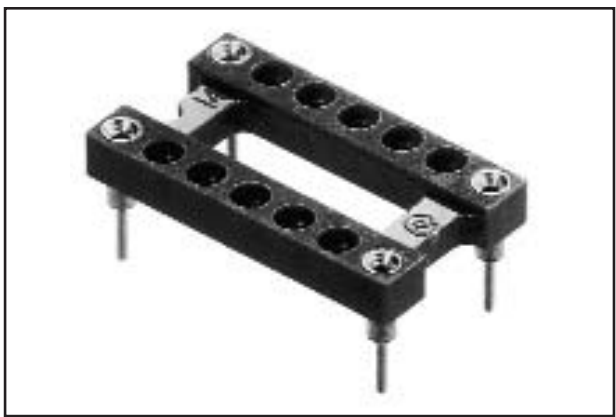
Note: Aries specializes in custom design and production. In addition to the standard products shown on this page, special materials, platings, sizes, and configurations can be furnished, depending on quantities. Aries reserves the right to change product specifications without notice