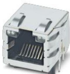
RJ45 socket insert, type: RJ45, degree of protection: IP20, number of positions: 8, 10 Gbps, connection method: Solder connection

Please be informed that the data shown in this PDF Document is generated from our Online Catalog. Please find the complete data in the user's documentation. Our General Terms of Use for Downloads are valid ( http://phoenixcontact.com/download )