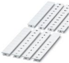
Zack marker strip, 10-section, horizontally labeled with the consecutive numbers: 1 ... 10, white, width: 7.5 mm

Please be informed that the data shown in this PDF Document is generated from our Online Catalog. Please find the complete data in the user's documentation. Our General Terms of Use for Downloads are valid ( http://phoenixcontact.com/download )