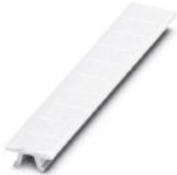
Zack marker strip, 10-section, horizontally labeled with the identical number: 11, white, width: 6 mm

Please be informed that the data shown in this PDF Document is generated from our Online Catalog. Please find the complete data in the user's documentation. Our General Terms of Use for Downloads are valid ( http://phoenixcontact.com/download )