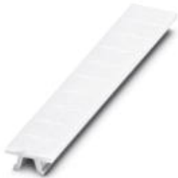
Zack marker strip, 10-section, vertically labeled with the consecutive numbers: 201 ... 210, white, width: 6 mm

Please be informed that the data shown in this PDF Document is generated from our Online Catalog. Please find the complete data in the user's documentation. Our General Terms of Use for Downloads are valid ( http://phoenixcontact.com/download )