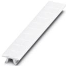
Zack marker strip, 10-section, horizontally labeled with the consecutive numbers: 11 ... 20, white, width: 6 mm

Please be informed that the data shown in this PDF Document is generated from our Online Catalog. Please find the complete data in the user's documentation. Our General Terms of Use for Downloads are valid ( http://phoenixcontact.com/download )