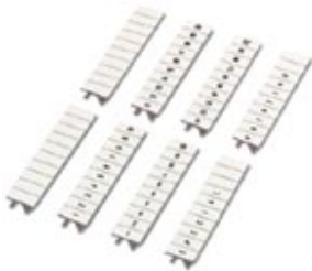
Zack marker strip, 10-section, horizontally labeled with the identical number: 0, white, width: 5 mm

Please be informed that the data shown in this PDF Document is generated from our Online Catalog. Please find the complete data in the user's documentation. Our General Terms of Use for Downloads are valid ( http://phoenixcontact.com/download )