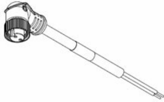
Series image - Reference only

Status: Active Series: 130006 Category: Molex Parts Engineering/Old PN: 105001K02F060