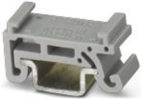
DIN rail adapter, width: 8 mm

Please be informed that the data shown in this PDF Document is generated from our Online Catalog. Please find the complete data in the user's documentation. Our General Terms of Use for Downloads are valid ( http://phoenixcontact.com/download )