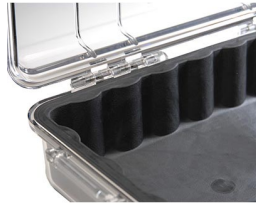
1031 Replacement Case Liner