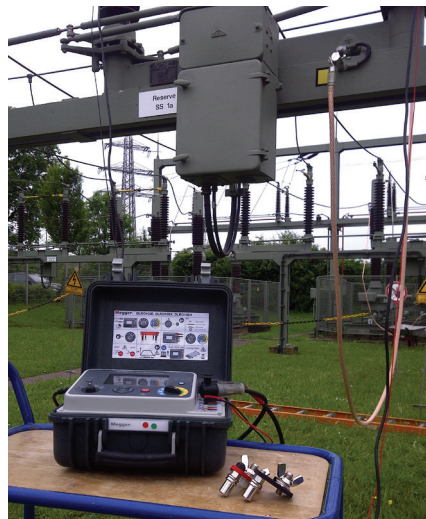
DLRO100 testing circuit breaker