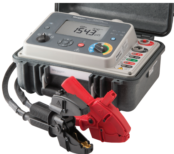
Optional CATIV 600 V Kelvin clips: two wire lead set (red/black) available in 5m, 10m or 15m lengths