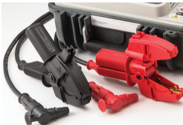
A new tough adjustable clamp has been designed to ensure flexibility in many applications and provides a good connection with the test piece