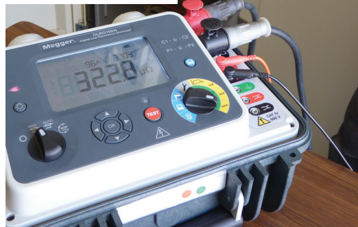
DLRO100H testing rack-mounted, 3-phase circuit breakers