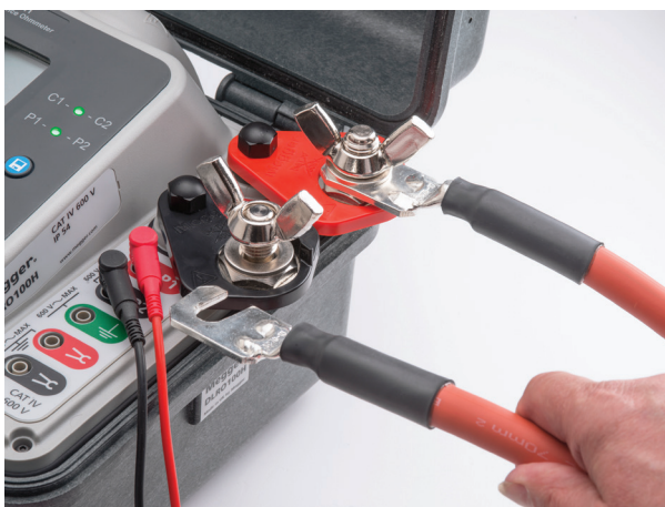
A new terminal adapter has been designed to enable the use of users own test leads.