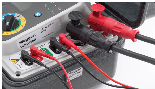
Robust, high-current CATIV leads for Kelvin configurations; current clamps for measurement on circuit breakers