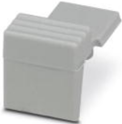
Manual release latch for PRC HR variants, color: gray

Please be informed that the data shown in this PDF Document is generated from our Online Catalog. Please find the complete data in the user's documentation. Our General Terms of Use for Downloads are valid ( http://phoenixcontact.com/download )