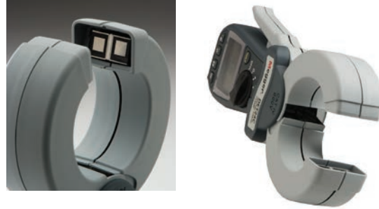
The clamp head of the DET14C/24C has a smooth mating surface and no interlocking teeth. Its large elliptical design improves access to the test specimen.