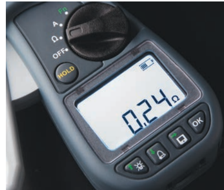
Close up of instrument's front panel.