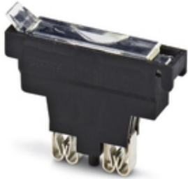
Fuse plug, nominal current: 10 A, length: 45.4 mm, width: 9.9 mm, color: black

Please be informed that the data shown in this PDF Document is generated from our Online Catalog. Please find the complete data in the user's documentation. Our General Terms of Use for Downloads are valid ( http://phoenixcontact.com/download )