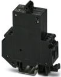
Thermomagnetic circuit breaker, 2-pos., normal blow, 1 N/O contact and 1 N/C contact, with universal foot for mounting on NS 32 or NS 35

Please be informed that the data shown in this PDF Document is generated from our Online Catalog. Please find the complete data in the user's documentation. Our General Terms of Use for Downloads are valid ( http://phoenixcontact.com/download )