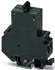
Thermomagnetic circuit breaker, 2-pos., normal blow, 1 N/O contact and 1 N/C contact, with universal foot for mounting on NS 32 or NS 35

Please be informed that the data shown in this PDF Document is generated from our Online Catalog. Please find the complete data in the user's documentation. Our General Terms of Use for Downloads are valid ( http://phoenixcontact.com/download )