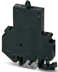
Thermomagnetic circuit breaker, 1-pos., normal blow, 1 N/O contact, with universal foot for mounting on NS 32 or NS 35

Please be informed that the data shown in this PDF Document is generated from our Online Catalog. Please find the complete data in the user's documentation. Our General Terms of Use for Downloads are valid ( http://phoenixcontact.com/download )