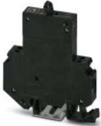
Thermomagnetic circuit breaker, 1-pos., normal blow, 1 N/O contact, with universal foot for mounting on NS 32 or NS 35

Please be informed that the data shown in this PDF Document is generated from our Online Catalog. Please find the complete data in the user's documentation. Our General Terms of Use for Downloads are valid ( http://phoenixcontact.com/download )