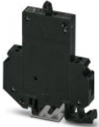
Thermomagnetic circuit breaker, 1-pos., fast blow, 1 N/C contact, with universal foot for mounting on NS 32 or NS 35

Please be informed that the data shown in this PDF Document is generated from our Online Catalog. Please find the complete data in the user's documentation. Our General Terms of Use for Downloads are valid ( http://phoenixcontact.com/download )