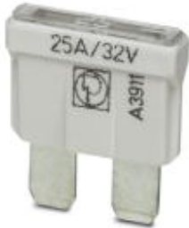
Flat-type plug-in fuse, type C, color code: white, nominal current: 25 A

Please be informed that the data shown in this PDF Document is generated from our Online Catalog. Please find the complete data in the user's documentation. Our General Terms of Use for Downloads are valid ( http://phoenixcontact.com/download )