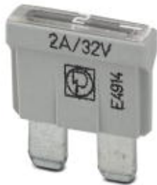
Flat-type plug-in fuse, type C, color code: gray, nominal current: 2 A

Please be informed that the data shown in this PDF Document is generated from our Online Catalog. Please find the complete data in the user's documentation. Our General Terms of Use for Downloads are valid ( http://phoenixcontact.com/download )