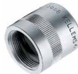
Thread Adapter 091041006