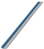
Continuous plug-in bridge, length: 500 mm, color: blue

Continuous plug-in bridge - FBST 500-PLC BU - 2966692