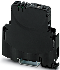
Electronic circuit breaker, signal contact: 1 N/O contact, nominal current: 3 A

Please be informed that the data shown in this PDF Document is generated from our Online Catalog. Please find the complete data in the user's documentation. Our General Terms of Use for Downloads are valid ( http://phoenixcontact.com/download )