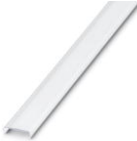
Cover, transparent, unlabeled, lettering field size: 1000 x 15 mm

Please be informed that the data shown in this PDF Document is generated from our Online Catalog. Please find the complete data in the user's documentation. Our General Terms of Use for Downloads are valid ( http://phoenixcontact.com/download )