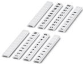
Zack marker strip flat, 10-section, horizontally labeled with the consecutive odd numbers: 21 ... 39, white

Please be informed that the data shown in this PDF Document is generated from our Online Catalog. Please find the complete data in the user's documentation. Our General Terms of Use for Downloads are valid ( http://phoenixcontact.com/download )